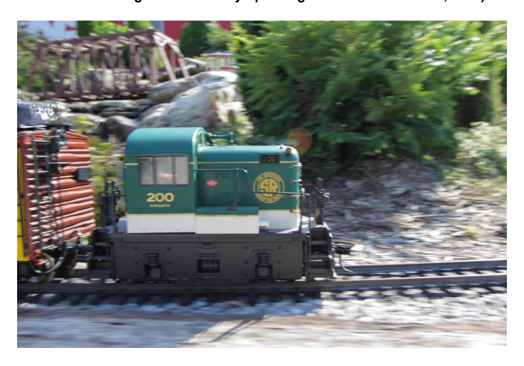
The "G" Model train engine "Little Critter" struts its stuff